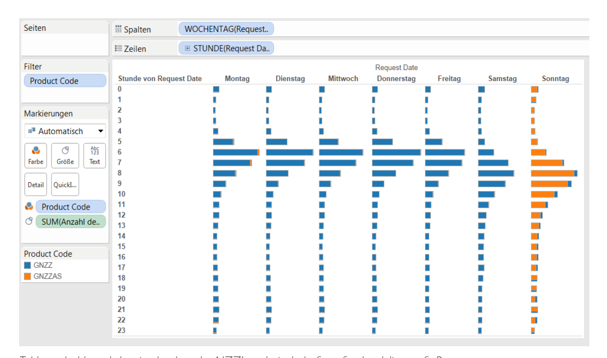
Tableau dashboard showing load on the NZZ's technical platform for the delivery of ePapers.

NZZ regularly analyzes a variety of local and online data sources based on SQL Server, IBM BigInsights, Adobe Analytics, flat Excel files, Amazon S3, and Apache Spark on Amazon EMR, among others.